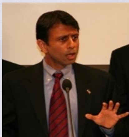
Bobby Jindal Governor of Louisiana