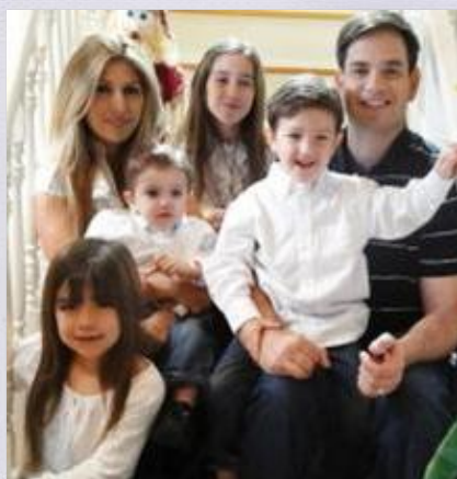
Marco Rubio U.S. Senator from Florida