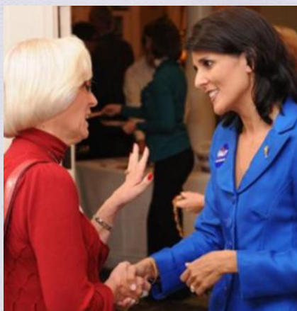
Nikki Haley Governor of South Carolina