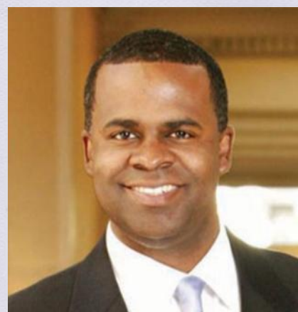
Kasim Reed Mayor of Atlanta, Georgia