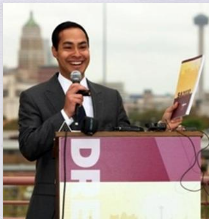
Julián Castro Mayor of San Antonio, Texas