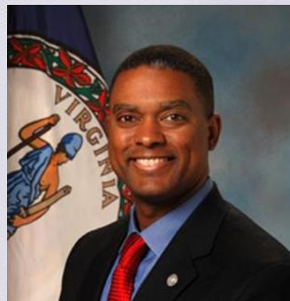
Gerald Robinson, Commissioner of Education State of Florida