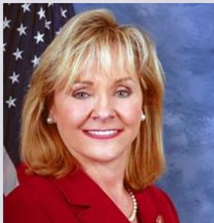
Mary Fallin Governor of Oklahoma