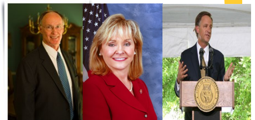
Safe Incumbents: Bentley/AL, Fallin/OK, Haslam/TN