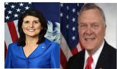
Incumbents Likely to Win: Haley/SC and Deal/GA

Arkansas may change from Democrat to Republican. Florida , with incumbent Rick Scott and former Governor Charlie Crist, is anybody's guess!