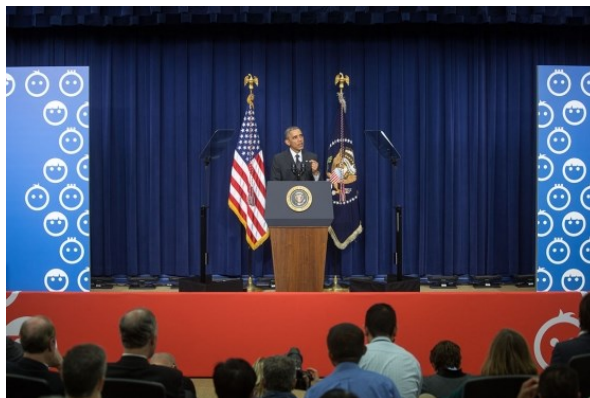
President Barack Obama hosts the White House Summit on Early Education in the Eisenhower Executive Office Building South Court Auditorium, Dec. 10, 2014.