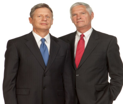
Libertarian Candidates for President & Vice-President Governor Gary Johnson & Judge Jim Gray