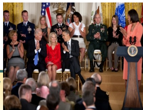
President Obama, Vice-President Biden, Dr. Jill Biden and First Lady Michelle Obama Launch Joining Forces

“All Americans should know that one act of kindness extended to a family of a soldier, a sailor or Marine, a Coast Guardsman, reverberates across water, over the mountains, and through the deserts, into the heart of the warrior who is standing alone.” Vice-President Biden